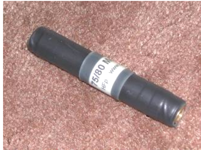
The HFp 80 Meter Coil

The 80 Meter coil allows the HFp to be resonated on 60 Meters (5.03 MHz), 75 Meters (4.0 MHz), and 80 Meters (3.5 MHz). It is added in to the element assembly as set up for 40 Meters, allowing the antenna to be set for resonance at the lower frequencies. The 80 Meter coil is only about 3.25" long, adding just a bit to the total antenna length. The included guy lines must be used in the Vertical 80 Meter configuration. An additional Laminated Card, showing the element configurations for 60 Meters, 75 Meters and 80 Meters is included. For the Dipole, two coils and the 40M extension must be ordered.