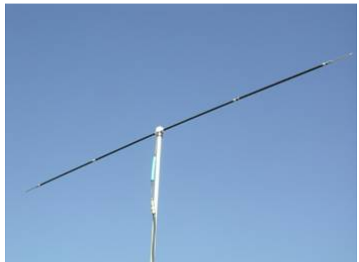
The HFp Dipole

The Vertical Upgrade Kit contains the extra parts to allow the Dipole to be configured as a ground-mounted vertical. The Vertical covers the bands from 40 to 6 Meters.