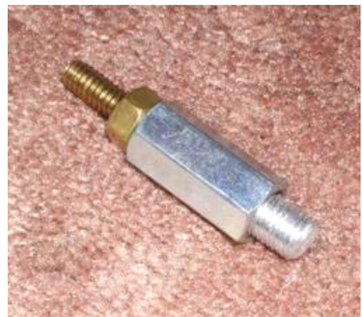
The HFp Mobile Mount Adaptor

Or, a mobile mount could be attached to some supporting structure, and the HFp installed or un-installed as desired. This would permit a semi-clandestine permanent antenna setup.